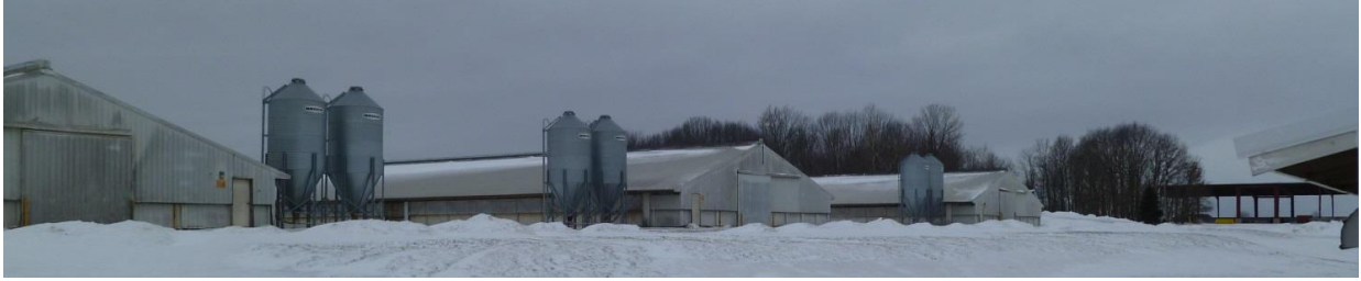
Figure 1: Finishing barns on the property of GDW Farms in Ottawa County, Michigan.

All high pressure sodium lights in the test barn were replaced with LEDs. LEDs not only last longer than high pressure sodium lights, they also consume less energy. This saves money since less maintenance is required, and less electricity is purchased. Also, the color spectrum can be easily altered with LEDs, which can be used to beneficially alter the behavior of the birds.