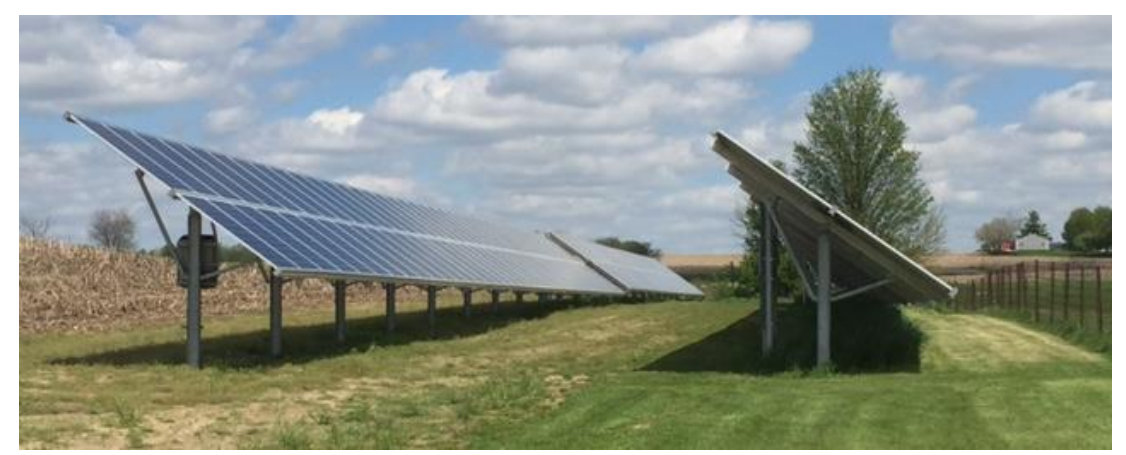
Figure 1 - The 75 kW solar energy system, positioned between a field and sheep pen.

Margaret recommended keeping track of production values and credits, and to communicate more with the utility, especially the utility's solar energy department, to work through any questions or concerns throughout the process.